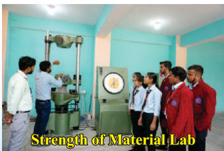
Strength of Material Lab