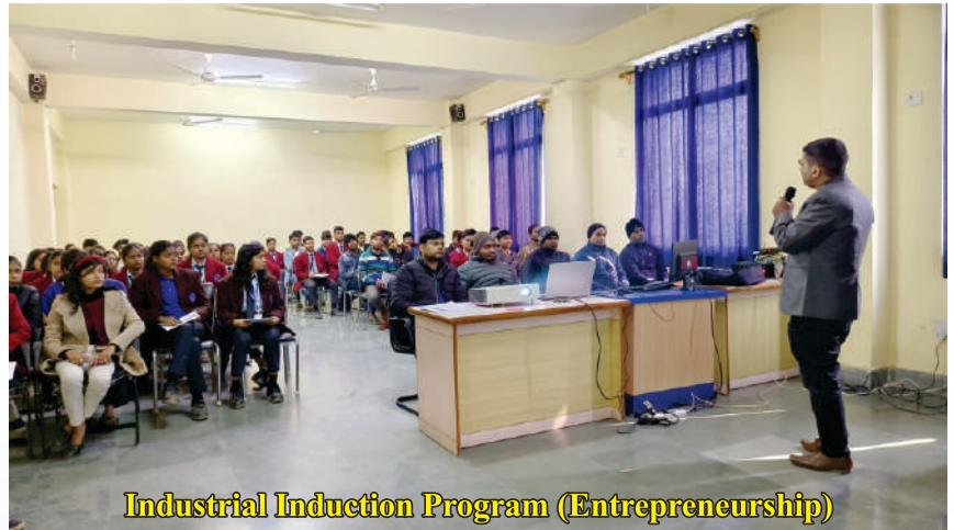
Industrial Induction Program (Entrepreneurship)