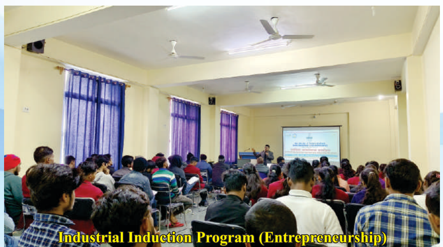
Industrial Induction Program (Entrepreneurship)