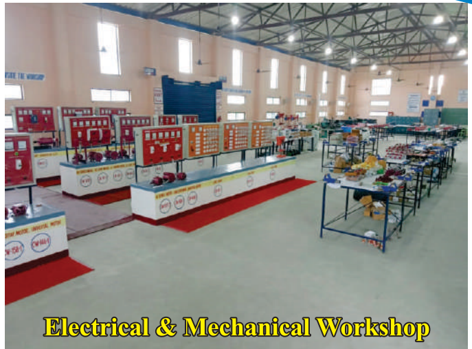
Electrical & Mechanical Workshop